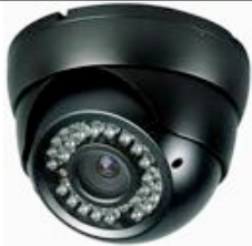
Choice of Cameras

GPS Speed & Mapping Dangerous Driver Charting 10-Year Warranty Available