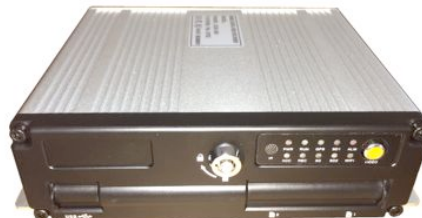
SD4D - Basic Series