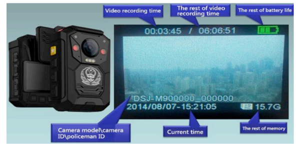
Display screen Description