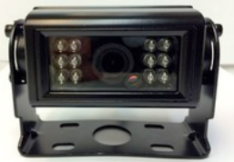
5 th Wheel Camera