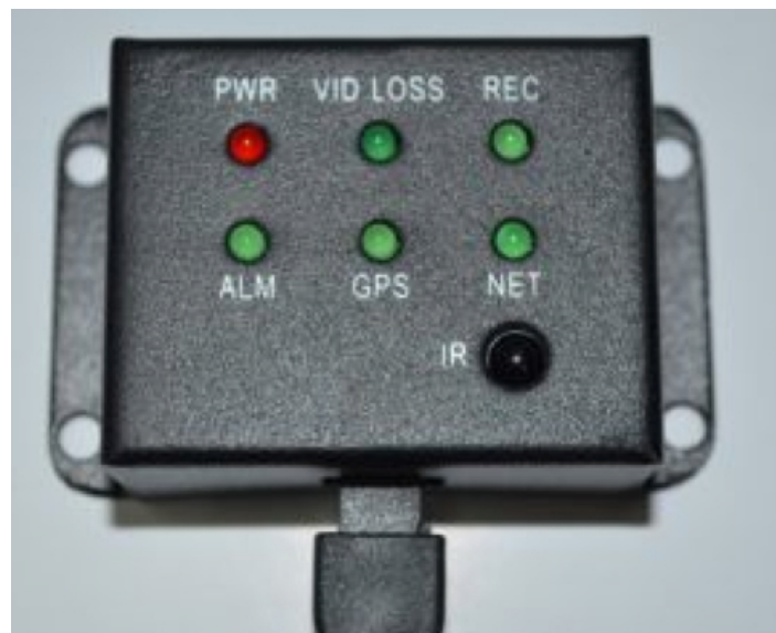
DVR Status LED Indicator Display

The DVR Status LED Indicator is an optional accessory of the Mobile DVR, which is mainly used to extend the LED indicator panel to a location where the driver can verify if the DVR is powered up, recording, GPS working, or if there is an alarm or video loss.