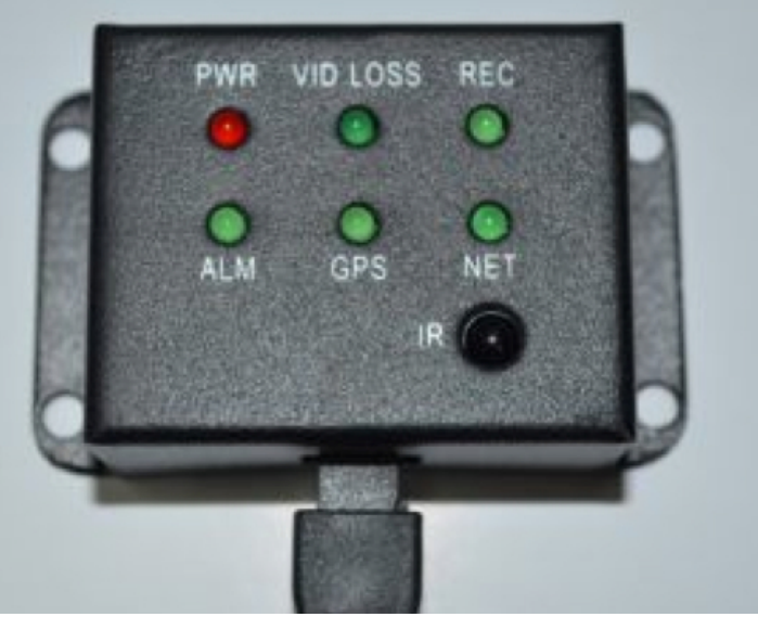
DVR Status LED Indicator Display

The DVR Status LED Indicator is an optional accessory of the Mobile DVR, which is mainly used to extend the LED indicator panel to a location where the driver can verify if the DVR is powered up, recording, GPS working, or if there is an alarm or video loss.