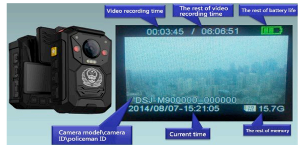
Display screen Description